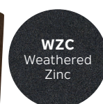
WZC Weathered Zinc