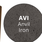
AVI Anvil Iron