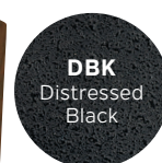
DBK Distressed Black